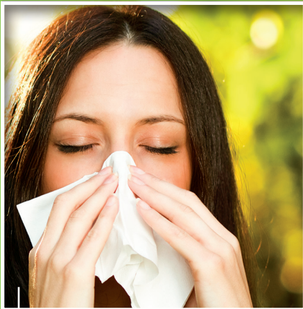
□ ITEM NO. 7099ED